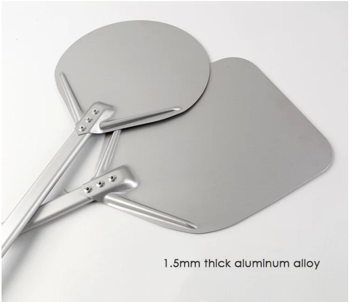
1.5mm thick aluminum alloy