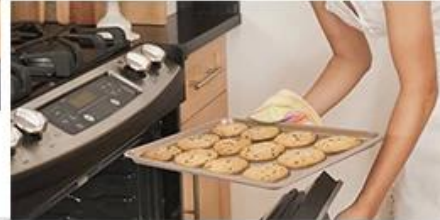
Enjoy family baking time