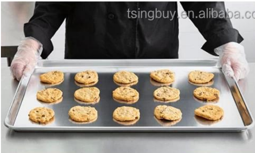
Commercial use in bakery food factory