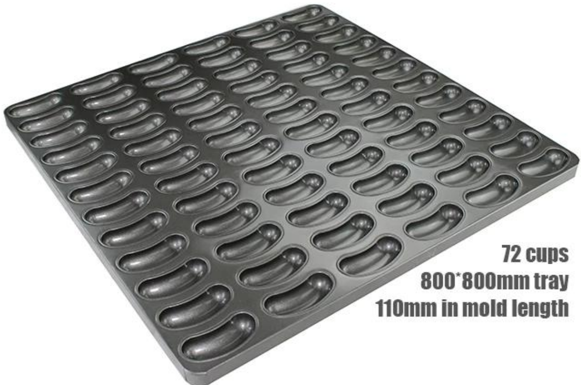
72 cups 800*800mm tray 110mm in mold length