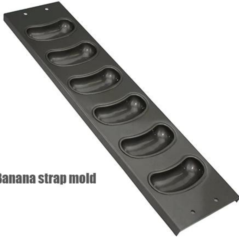
Banana strap mold