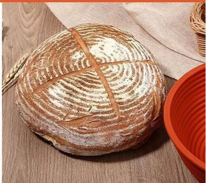
4. Bake the dough and enjoy it