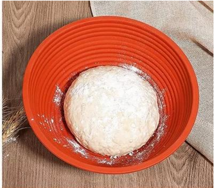
2. Place the dough in the basket