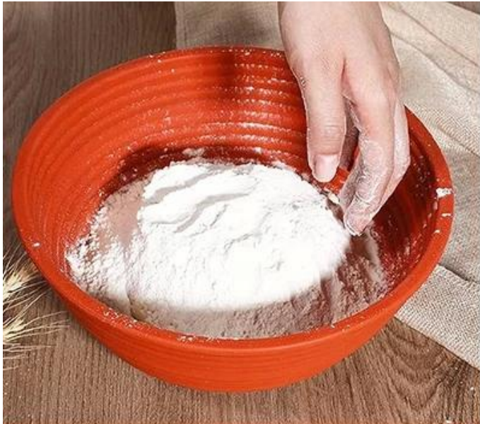
1. Sprinkle flour on the proofing basket