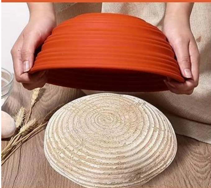
3. Take out the fermented dough