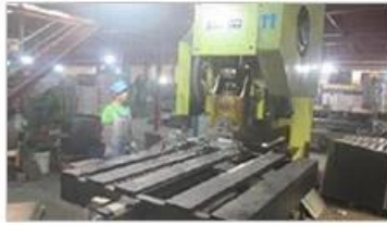
Automatic punching machine