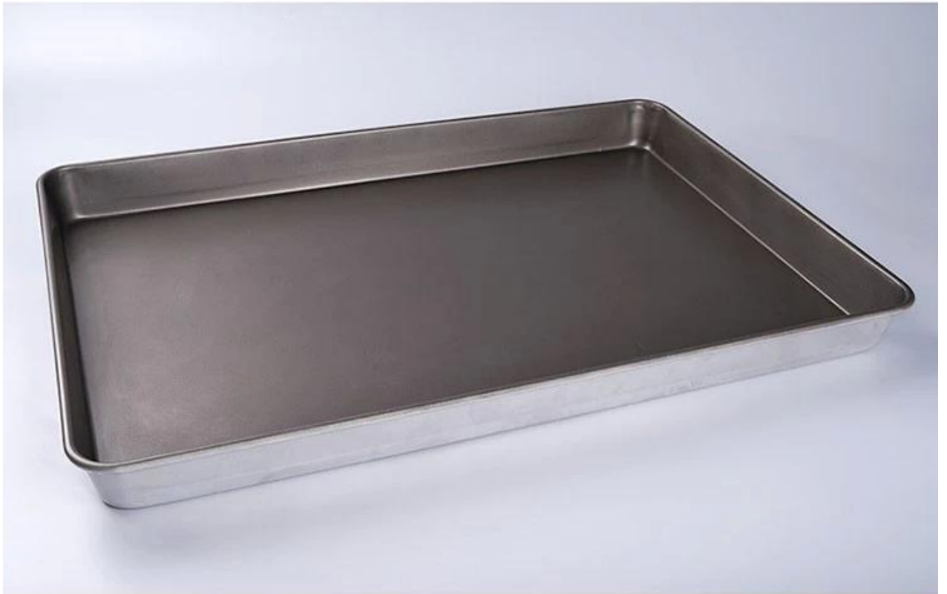
Aluminized Steel Material Light in weight, Good Heat Conductivity