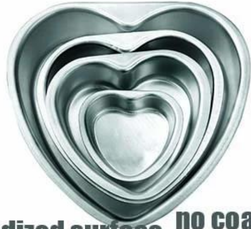
anodized surface no coating