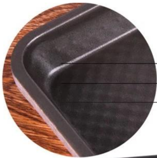
3 layer non stick coating