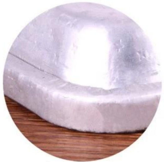
Square metal wire in rim curling edge