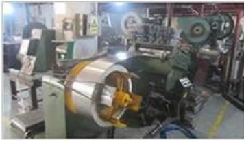
Automatic cutting machine