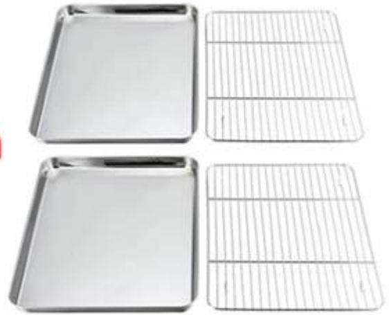
Sets with sheet pan