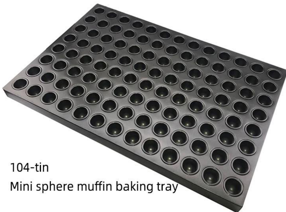
104-tin Mini sphere muffin baking tray