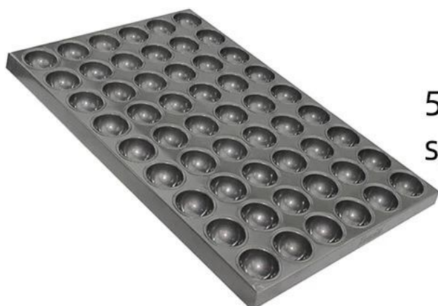
54-tin sphere molds