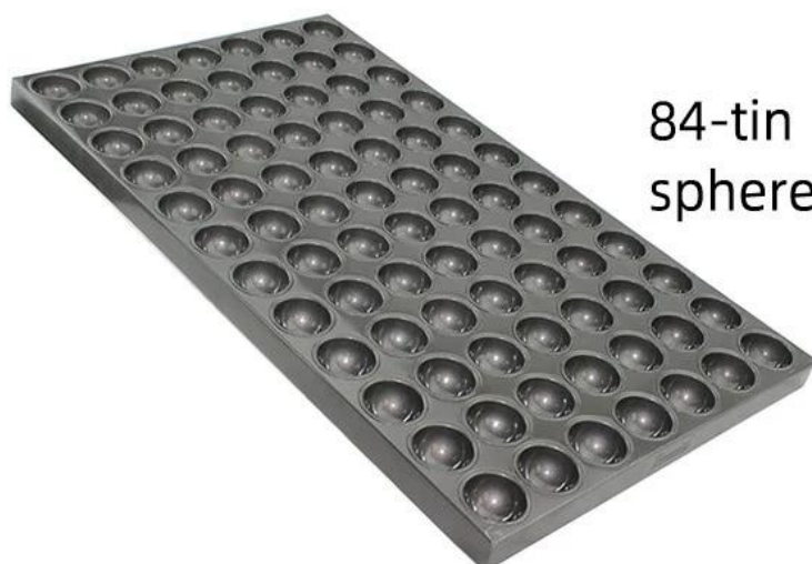
84-tin sphere molds