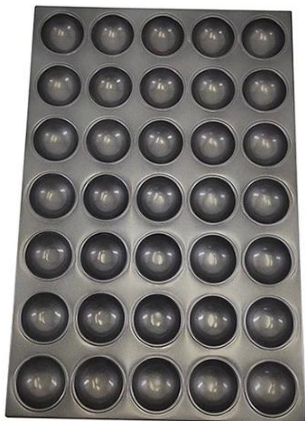
35-tin sphere muffin baking tray