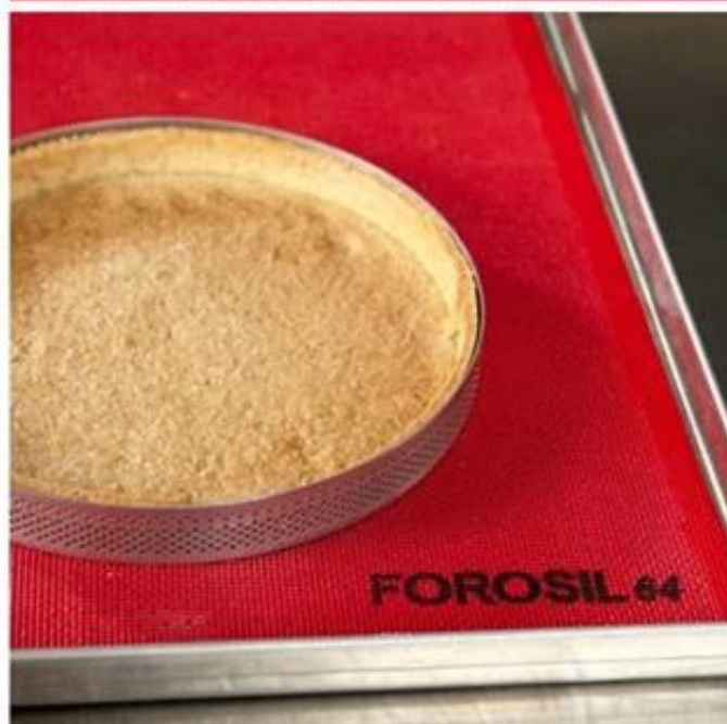
Imagens de produtos :