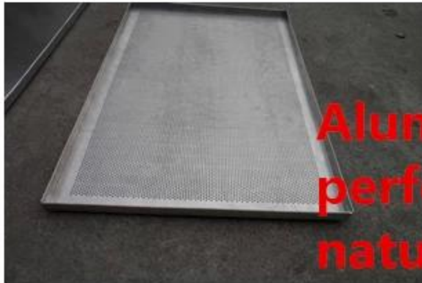
Aluminum/alusteel perforated/flat natural/with coating