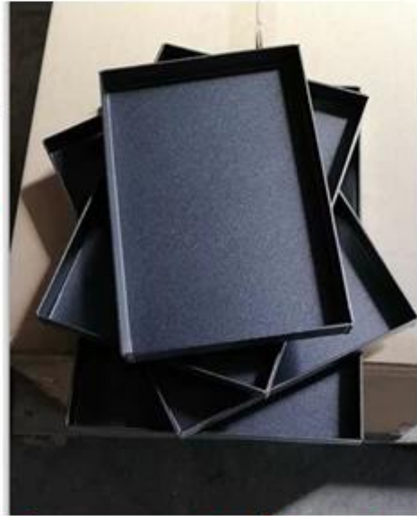
Customized size and thickness