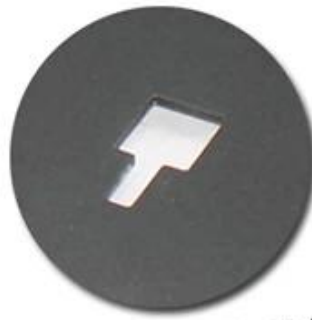
Locking buckle on the pan body and lid