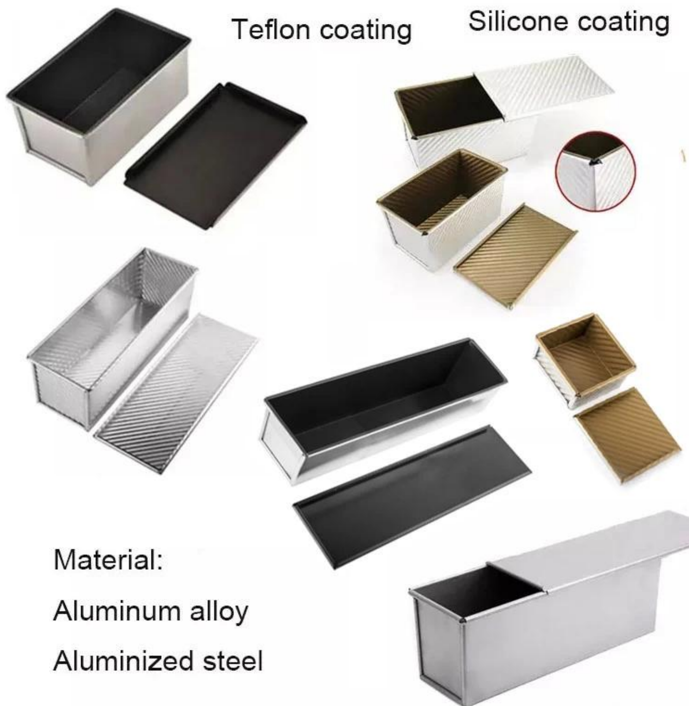
Strap loaf pan factory pictures