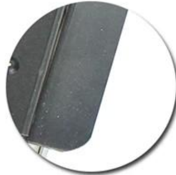
aluminized steel plate for handle

More type of strap loaf pan for your information