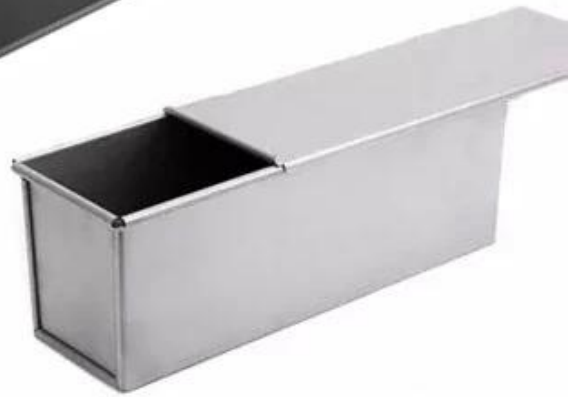
Strap loaf pan factory pictures