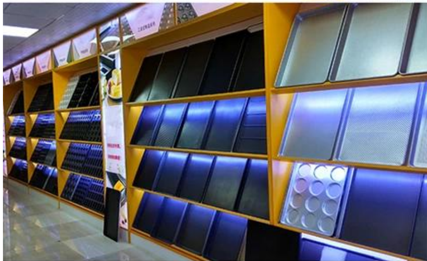
Sheet pan Drying pan