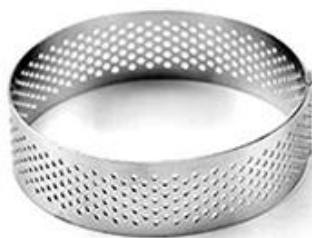
Round shape 70*70*20mm