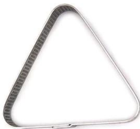
Triangle shape 83*75*20mm