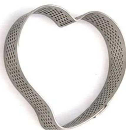
Heart shaped 76*71*20mm