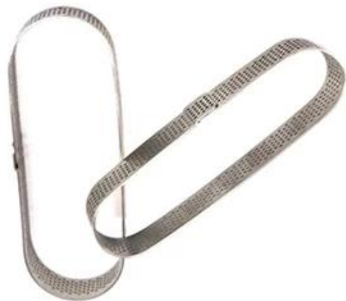
Oval shape 85*35*20mm