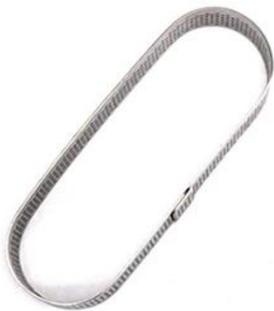
Oval shape 93*58*20mm