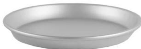
deep pizza pan