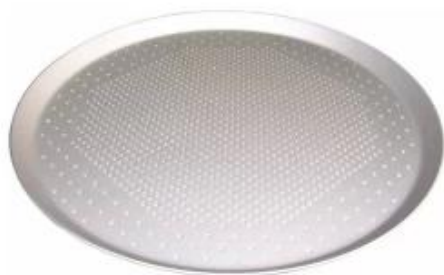
perforated pizza crisper pan