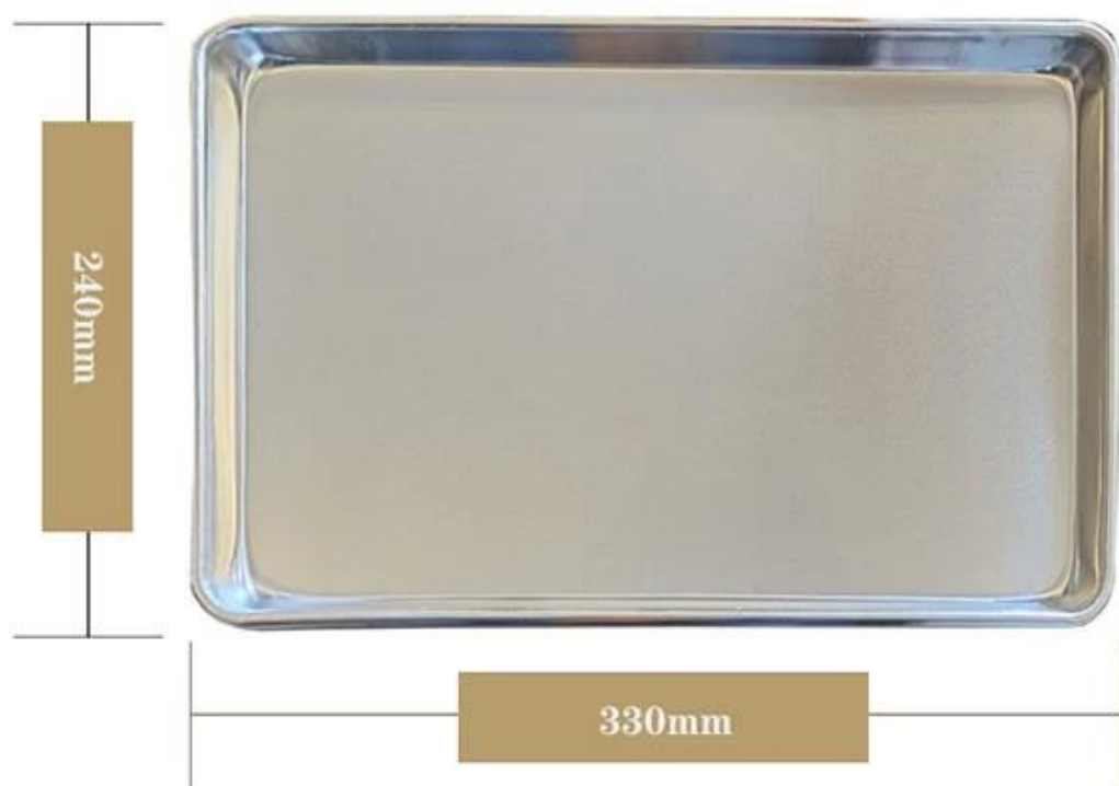
Quarter size baking sheet pan