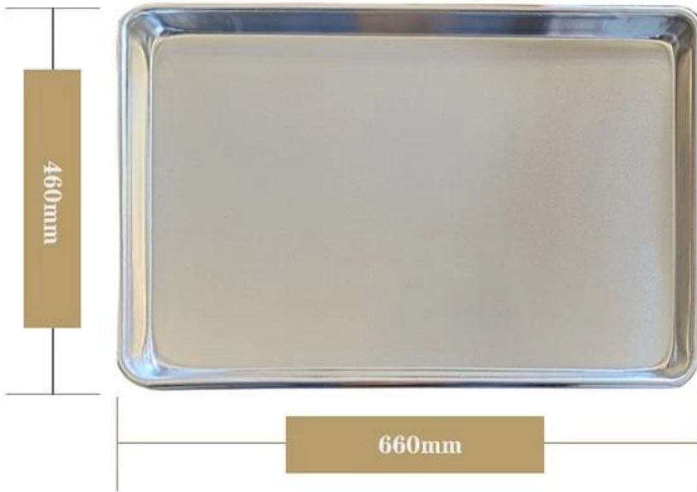
Full size baking sheet pan