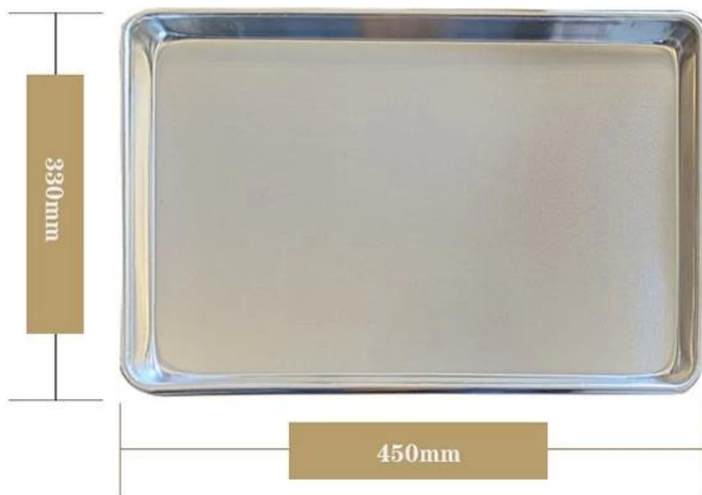
Half size baking sheet pan