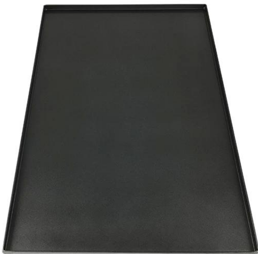
Silicone non stick coated surface