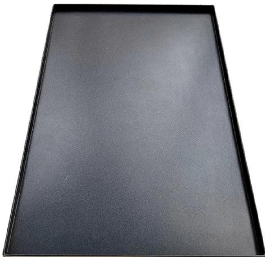
PTFE non stick coated surface