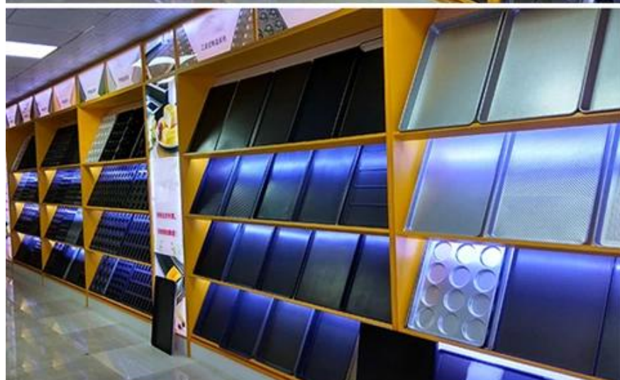
Sheet pan Drying pan