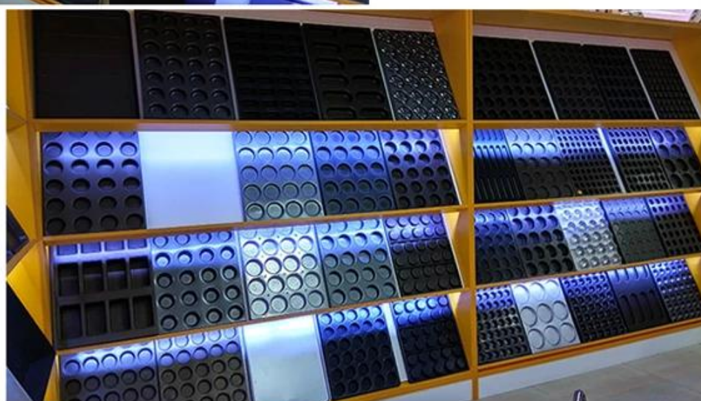
Multi-Mold Baking Tray