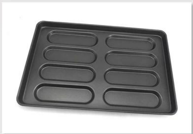
Aluminum Tart Tray