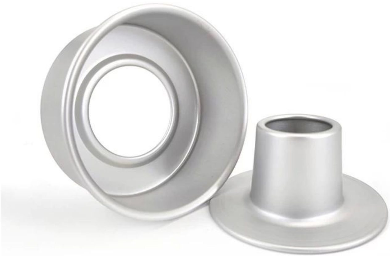
Bundt cake pan in application