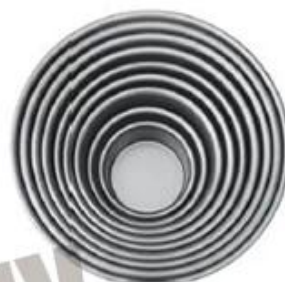
Round Cake Pan ( Anodized )