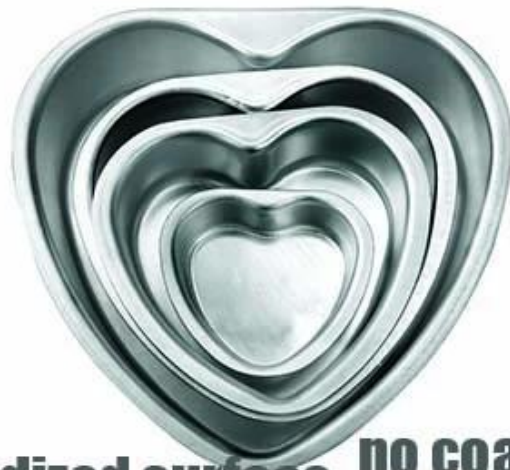
anodized surface no coating