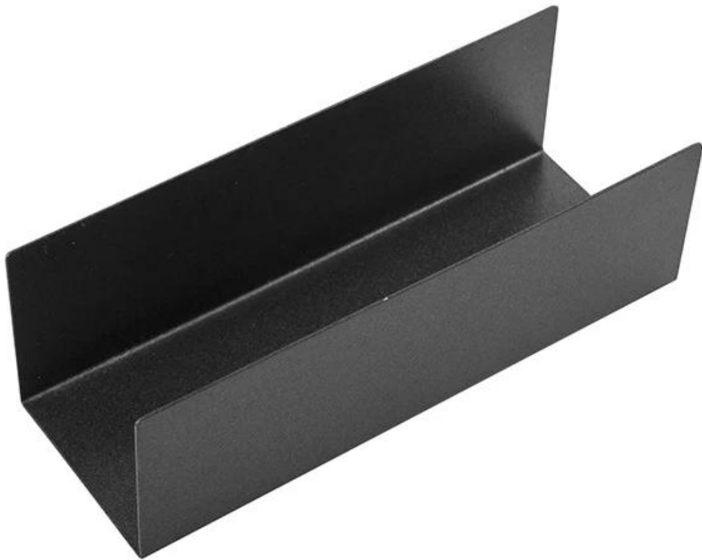
Details of U shape non-stick aluminum China loaf pan TSTP008