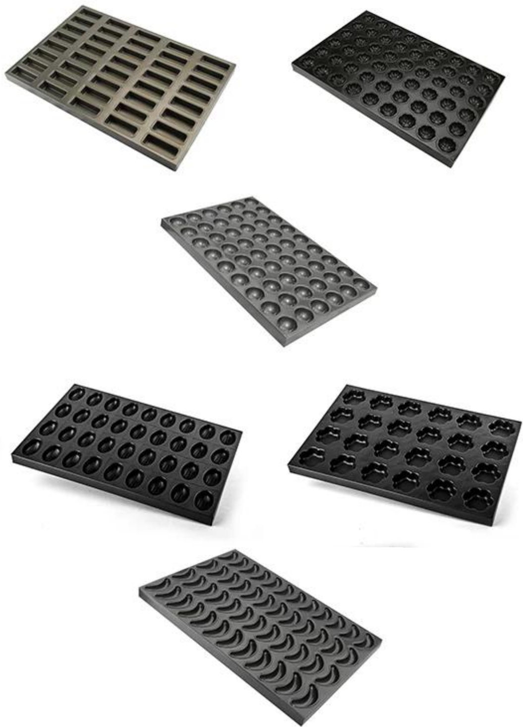
Factory pictures and customer visiting Tsingbuy customized baking tray manufacturer