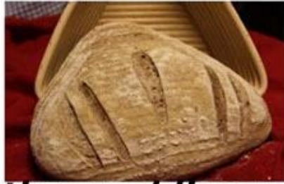
Formentation molding perfect banneton