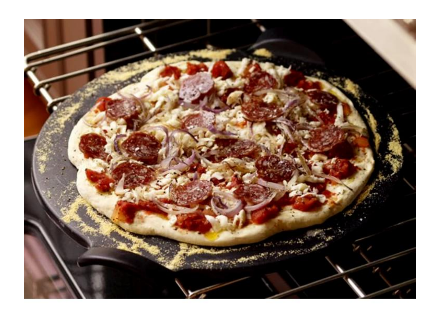
Other Patterns of Round Black Ceramic Baking Pizza Stone TSPS004