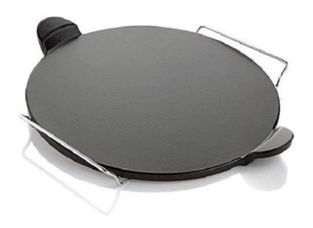
Other Popular Shapes of Baking Pizza Stone