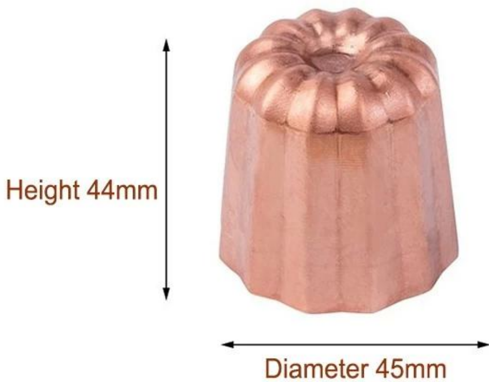
M Size Red Copper Canele Mold