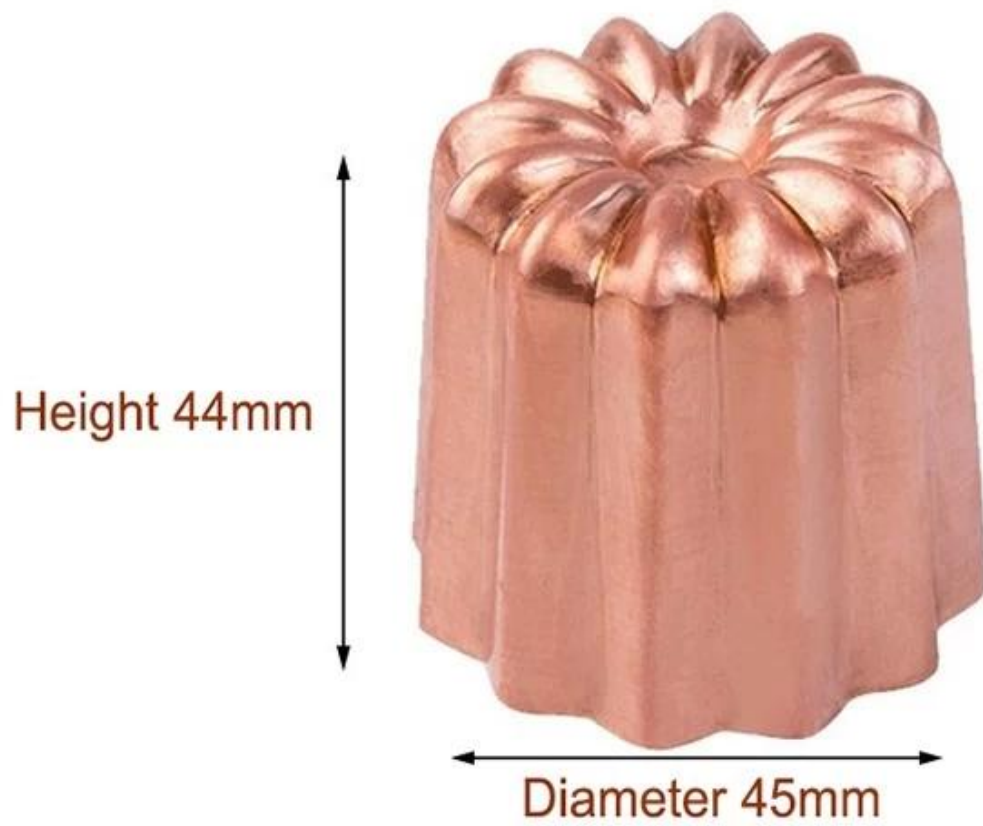
L Size Red Copper Canele Mold