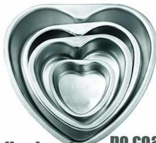
anodized surface no coating