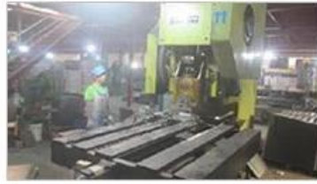
Automatic punching machine