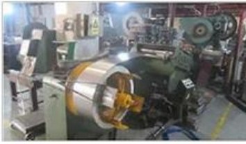
Automatic cutting machine