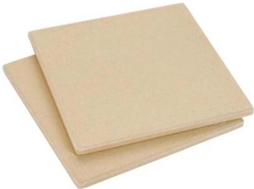
Customized baking pizza stone