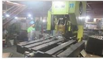
Automatic punching machine