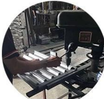
Standard production flow