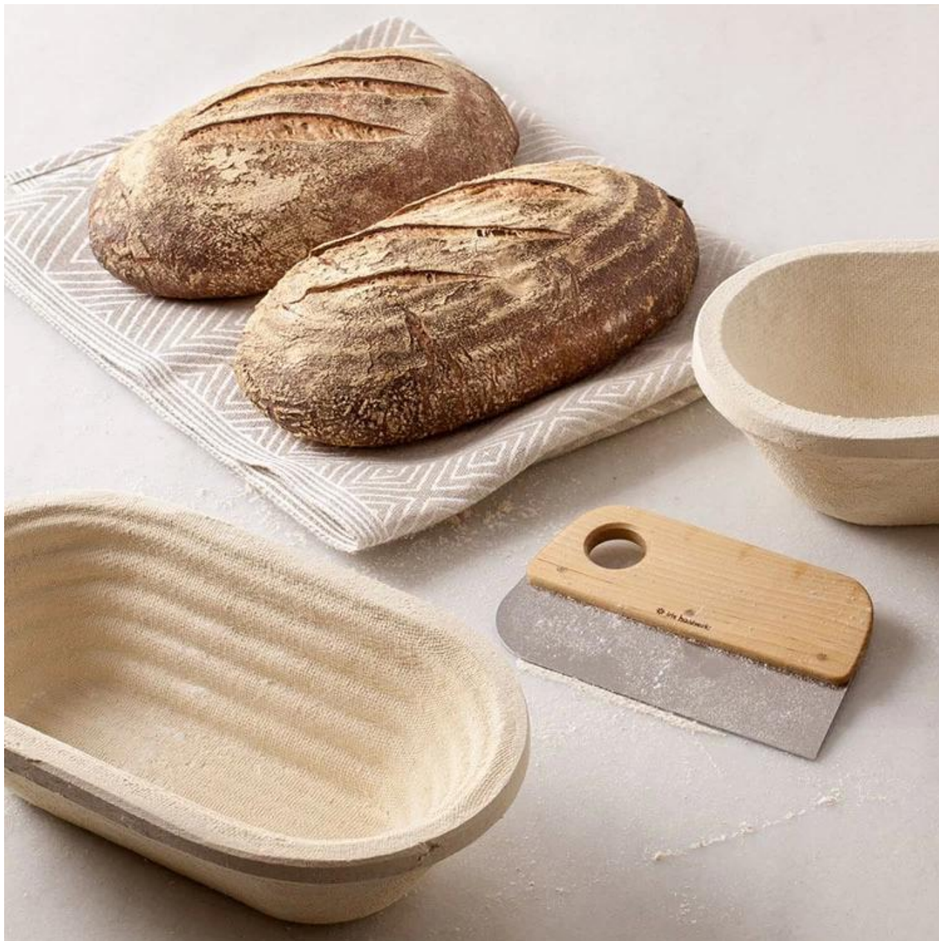
Banneton basket factory pictures