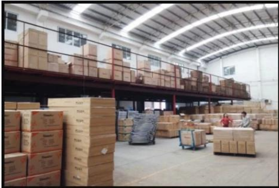
Sheet pan factory in China and Shipping Pictures