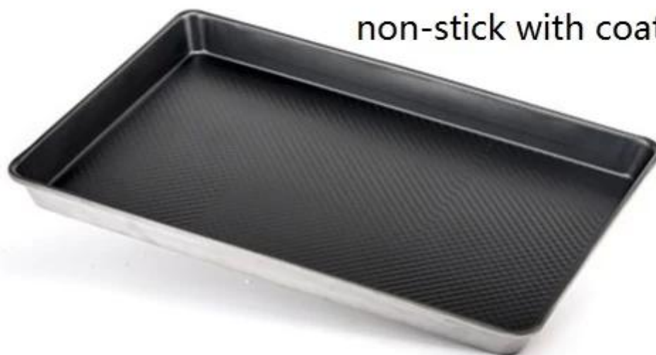
non-stick with coating