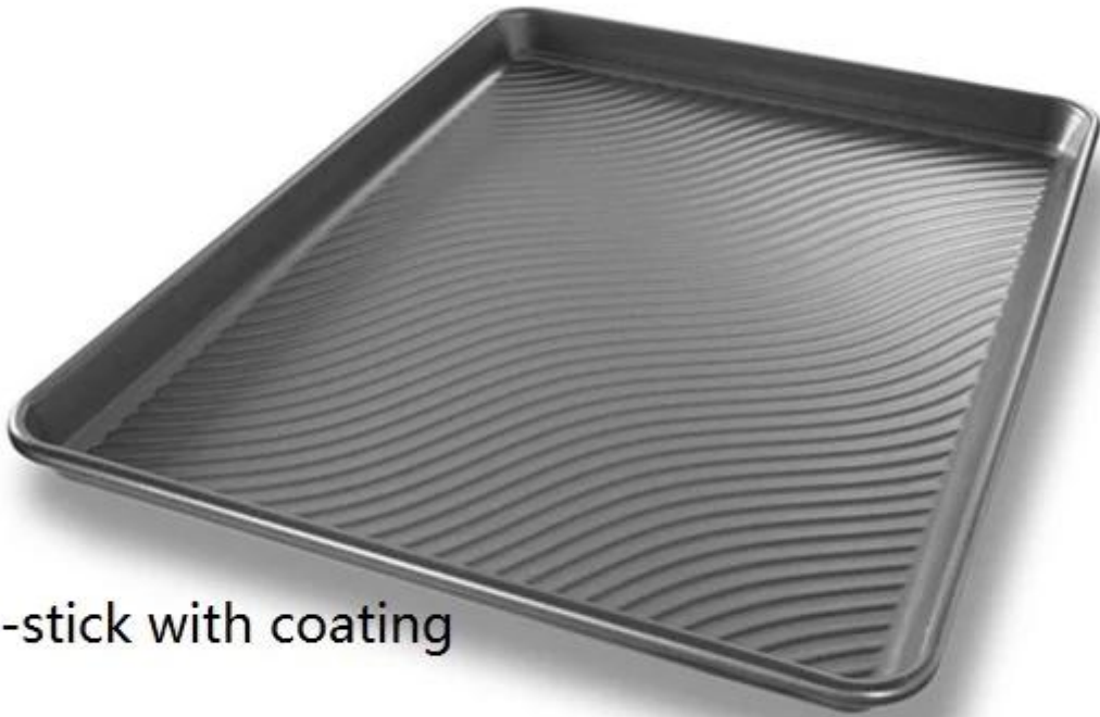
non-stick with coating