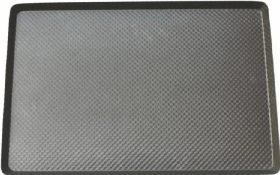
Details of non-stick corrugated alusteel baking sheet pan