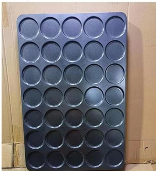
Large size for industrial use