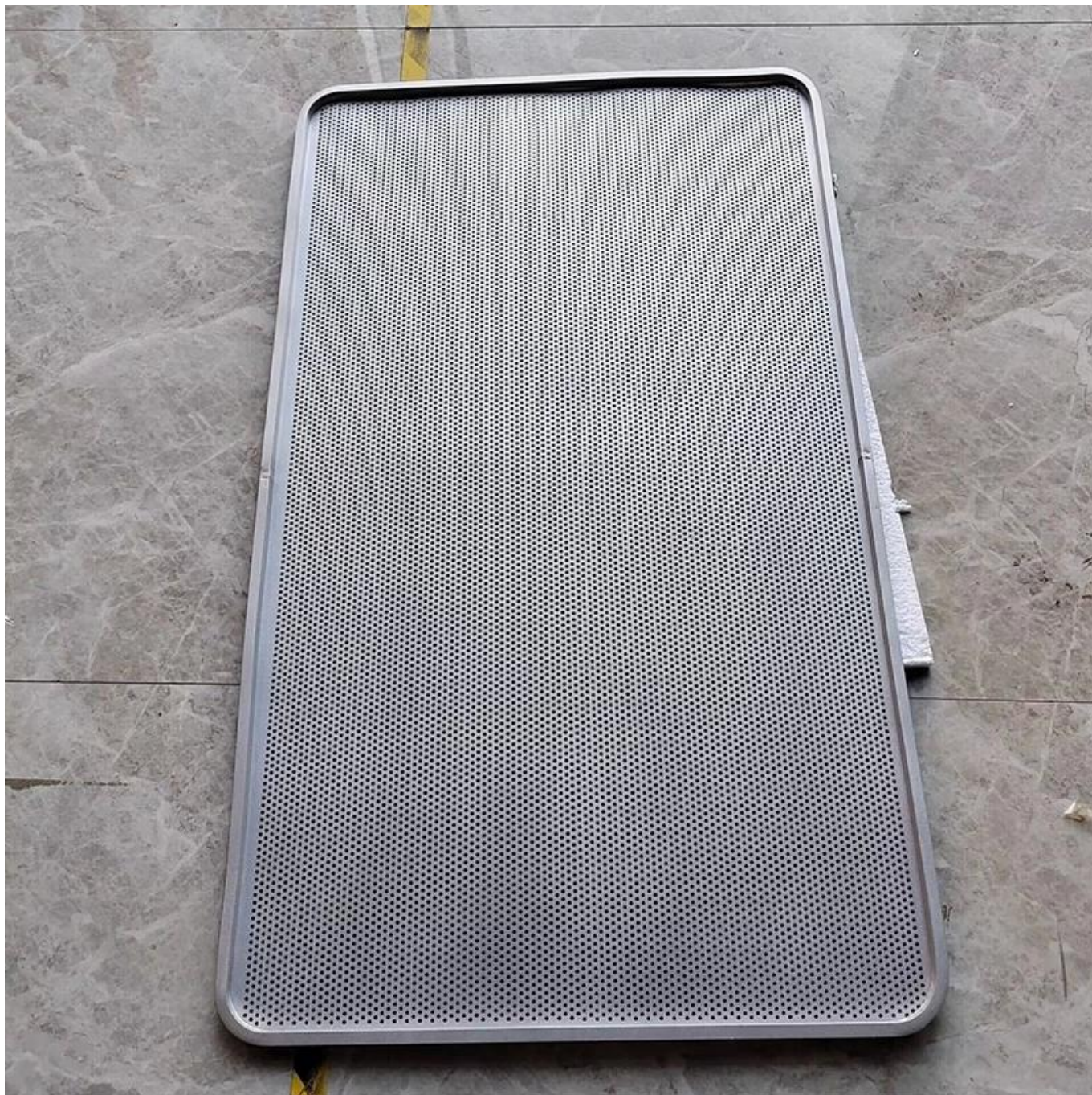
Perforated Flat Baking Sheet (Back Side)