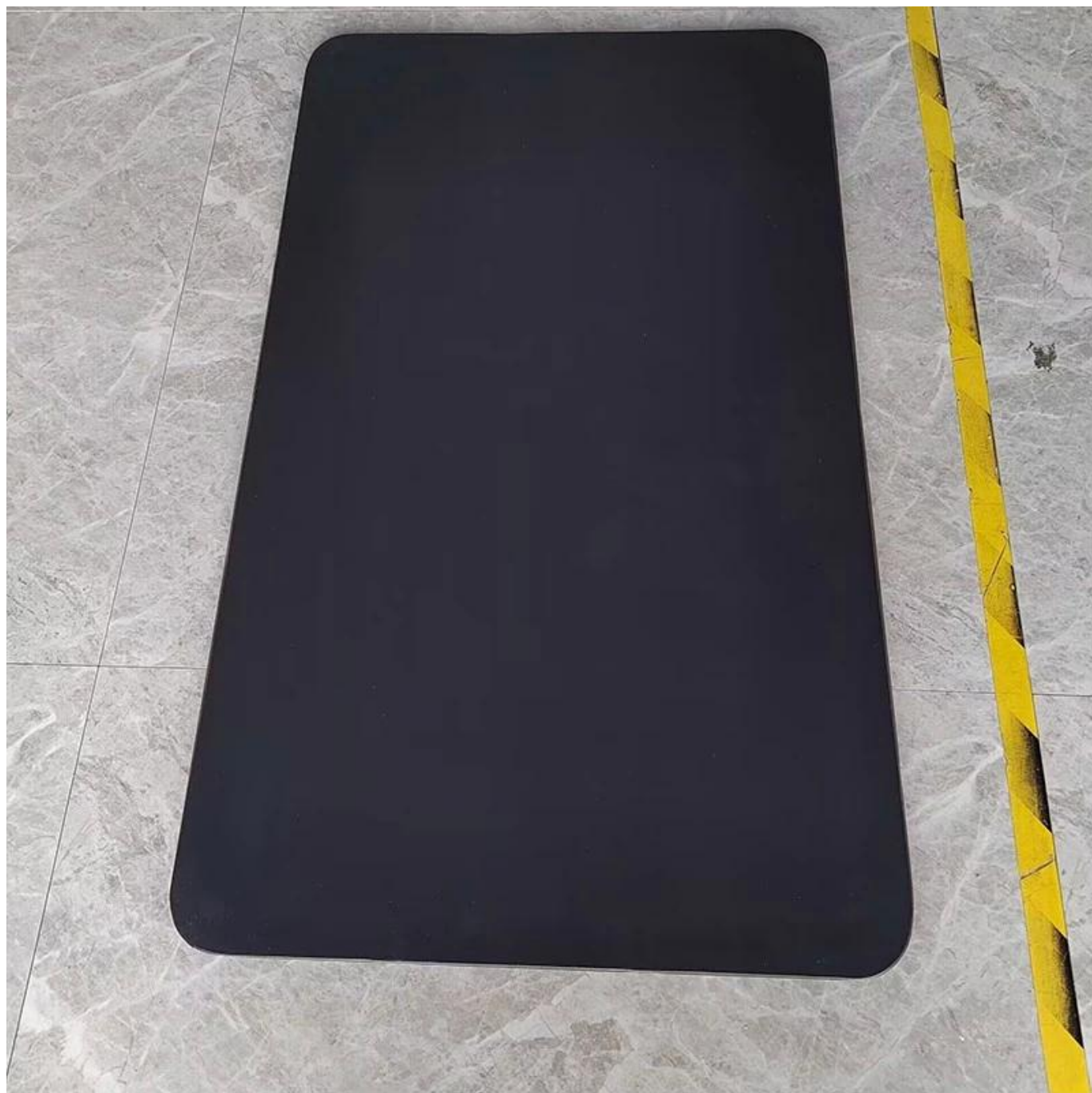
Non Stick Flat Baking Sheet (Front Side)