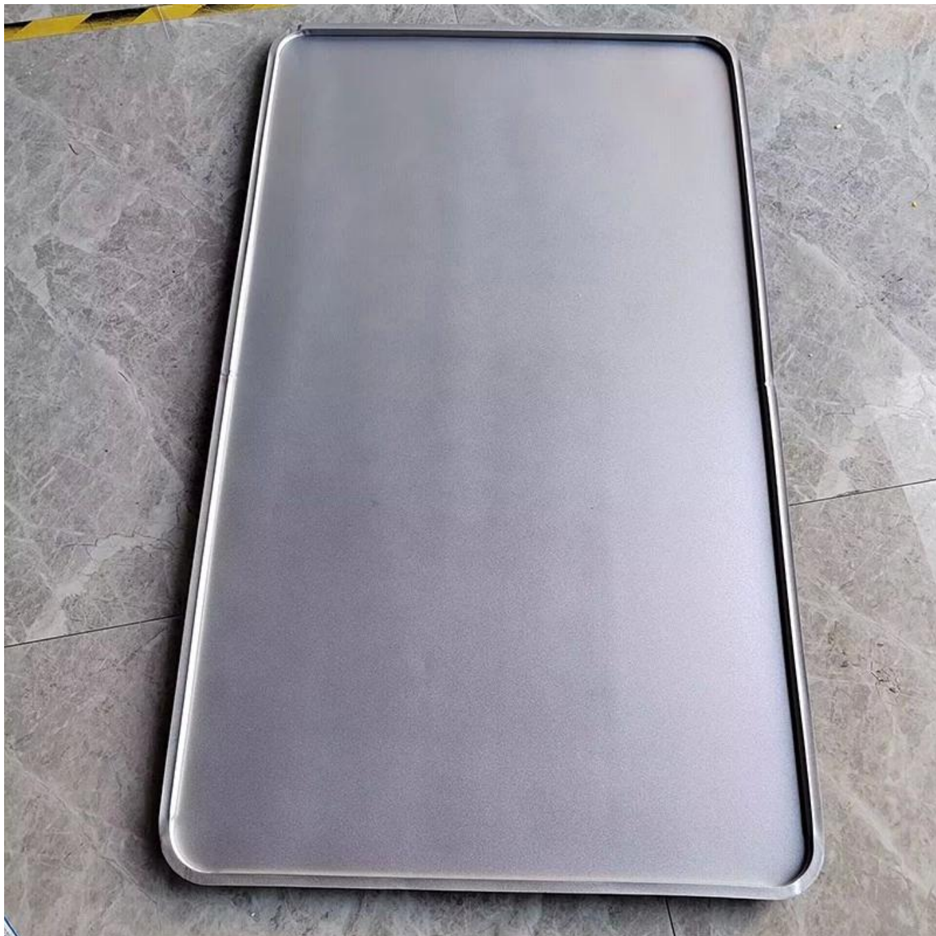
Non Stick Flat Baking Sheet (Back Side)