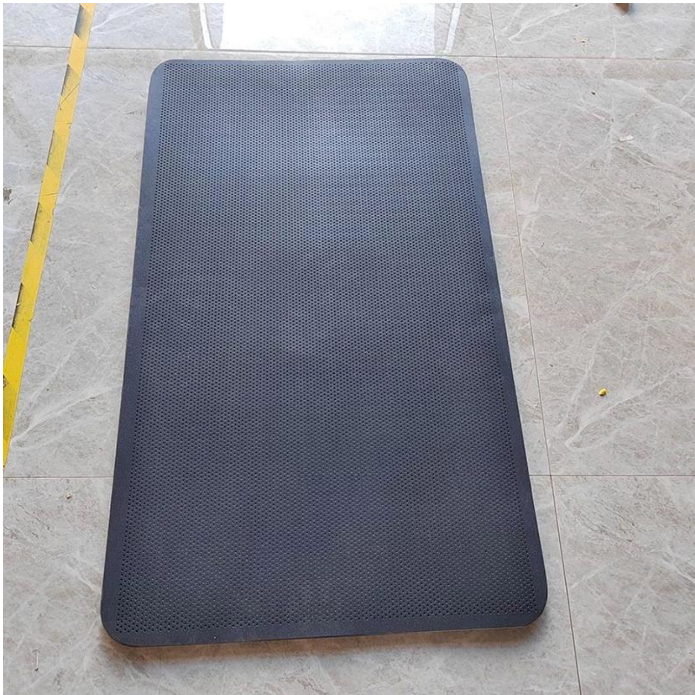
Perforated Flat Baking Sheet (Front Side)