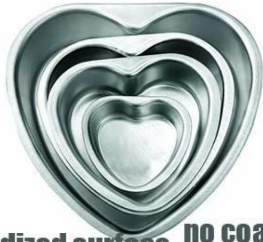
anodized surface no coating