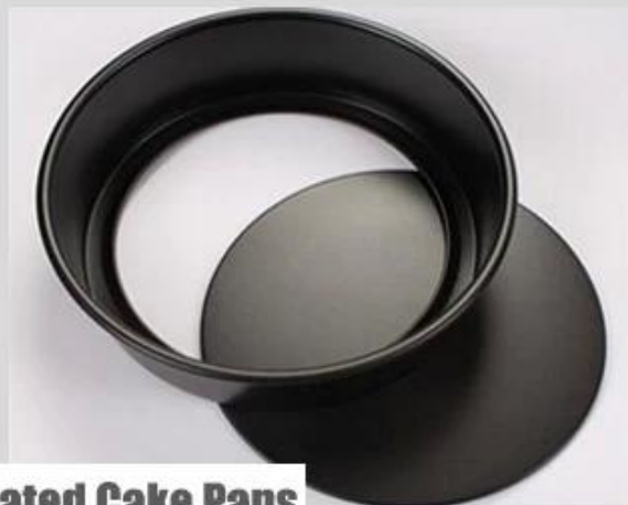
Non-stick Coated Cake Pans