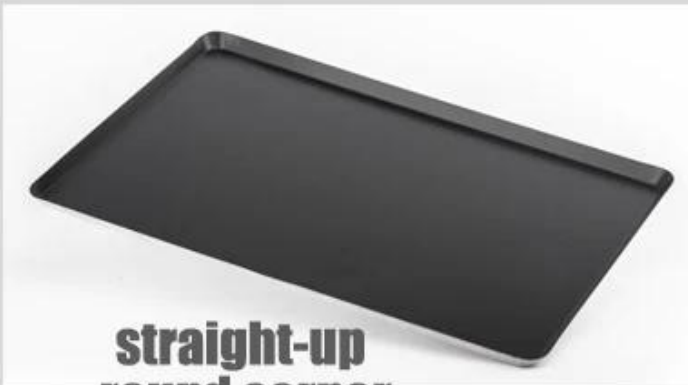
straight-up round corner