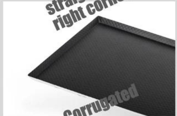
straight-up right corner