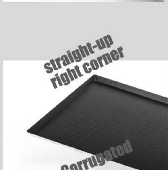
straight-up right corner