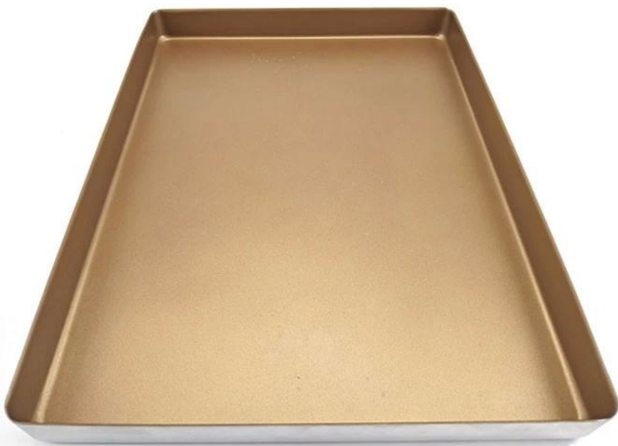
Thick Aluminum Baking Sheet Pan without Rim Straight Edges, Round Corners