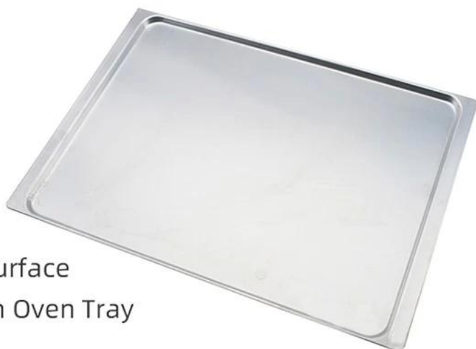
Natural Surface Aluminum Oven Tray