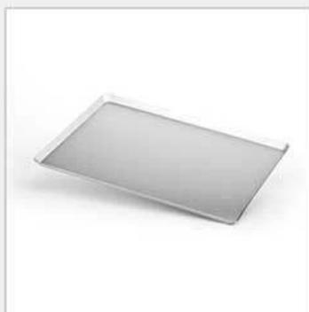
no wire rim