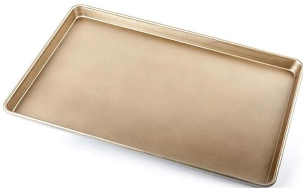
Machine stamp with metal wire curling rim