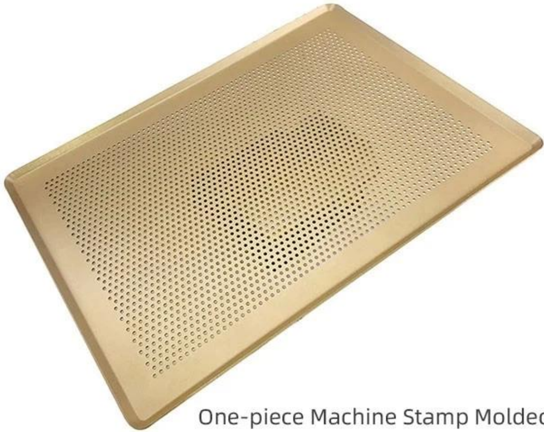
One-piece Machine Stamp Molded Baking Tray with Perforation