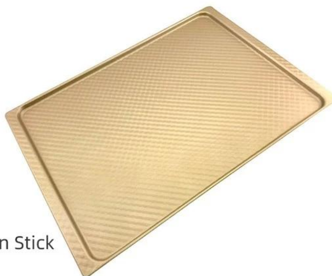
Corrugated Non Stick Oven Tray