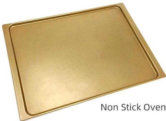
Non Stick Oven Tray