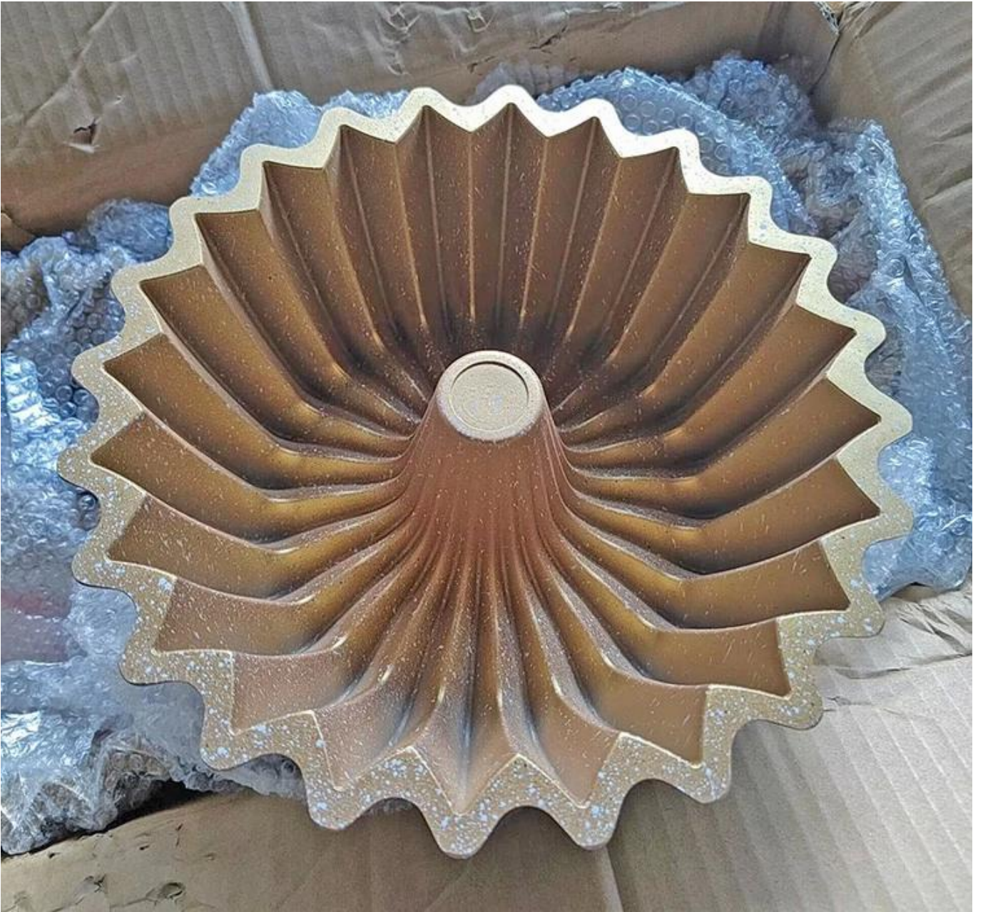
More model of die cast aluminum fluted bundt cake pan 3D cake baking molds