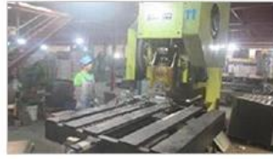
Automatic punching machine