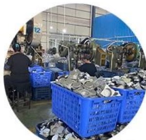
Quick production fast dispatch