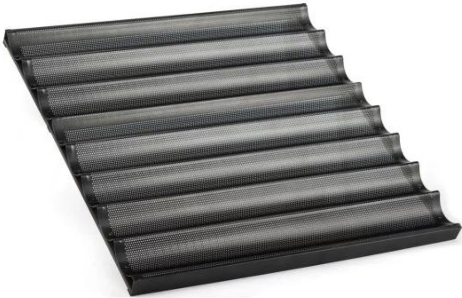
Details of factory customized 7 rows French baguette baking tray