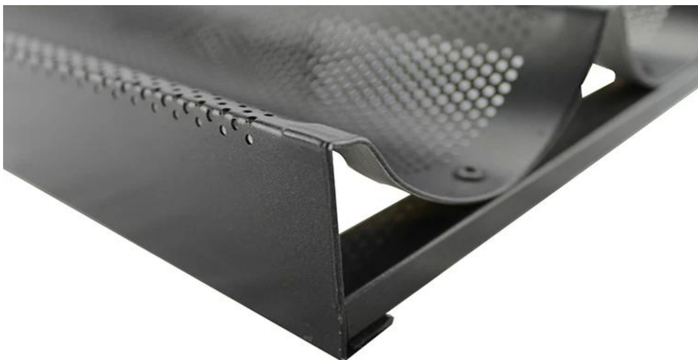
Aluminum alloy simple frame