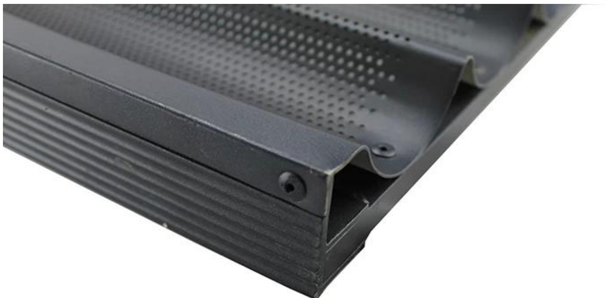
Aluminum alloy strengthening frame