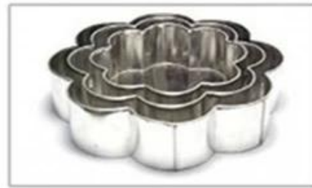
Factory and shipping pictures