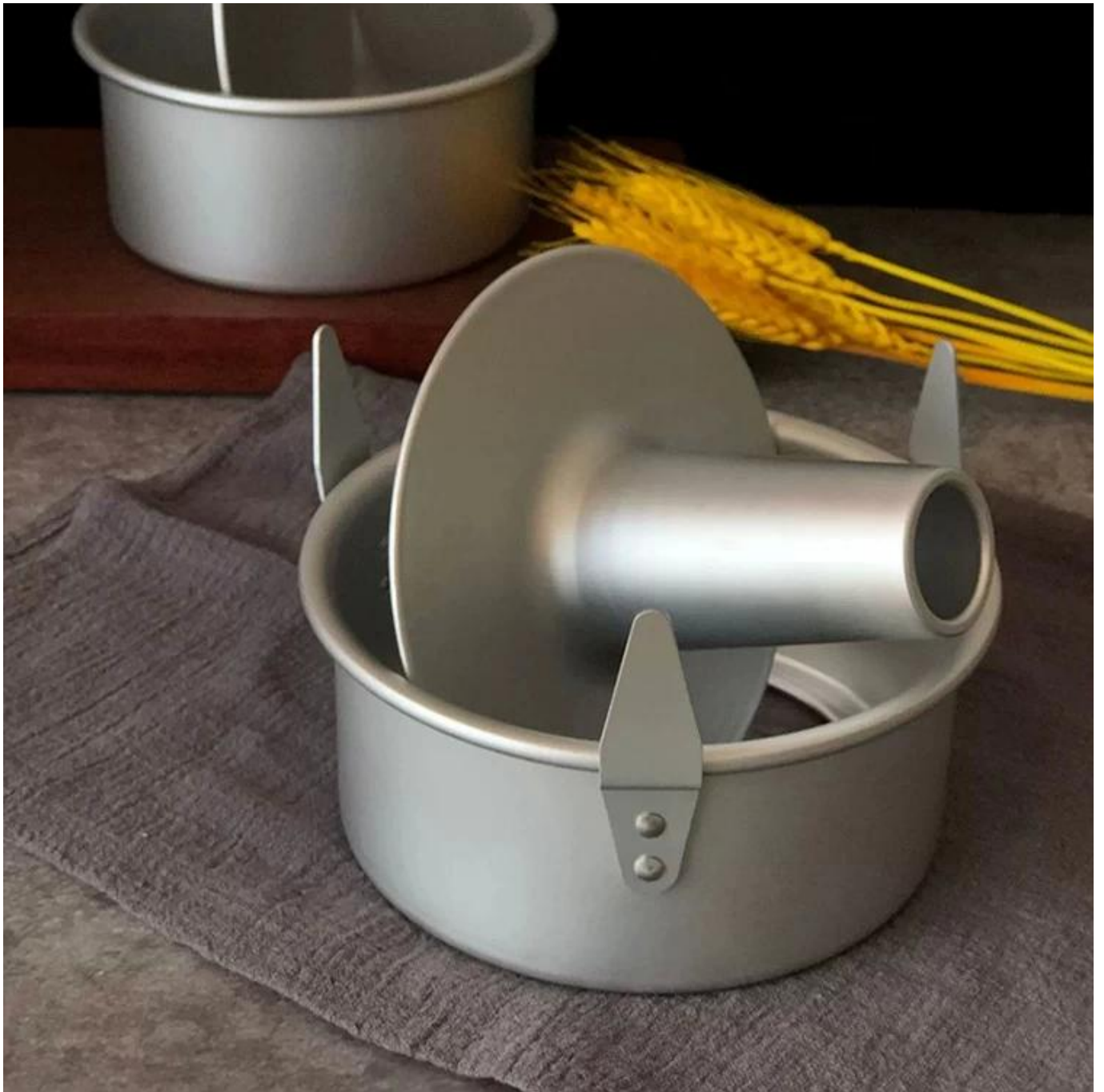
Similar Cake Mould