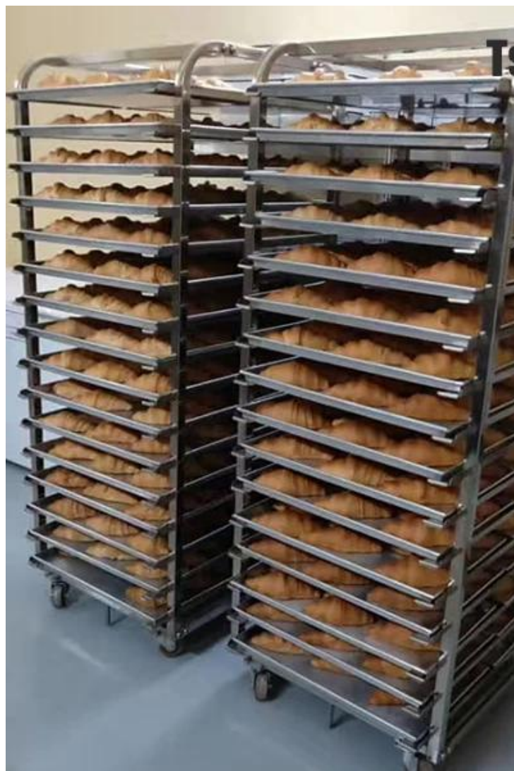
Tsingbuy Bakery Trolley custom baking pans