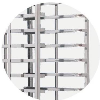
stainless steel tube material for holding trays