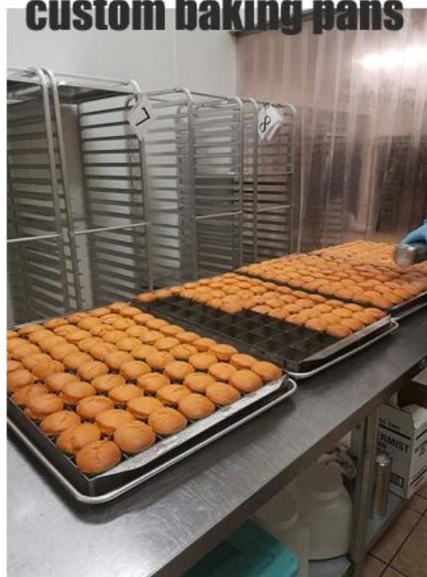
Use in Food Factory