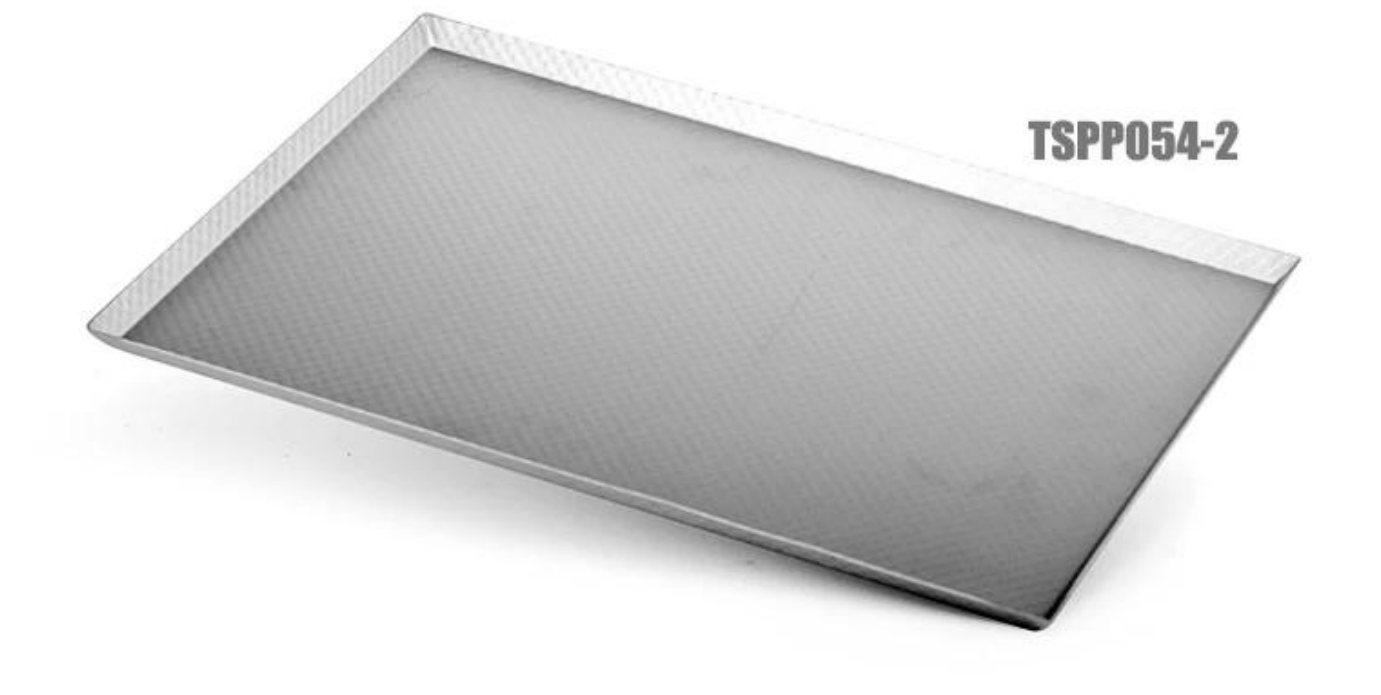
Details of Alusteel baking sheet pan 600 x 800mm TSPP054