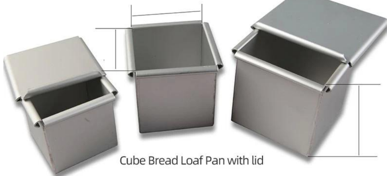
Cube Bread Loaf Pan with lid