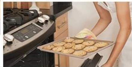
Enjoy family baking time