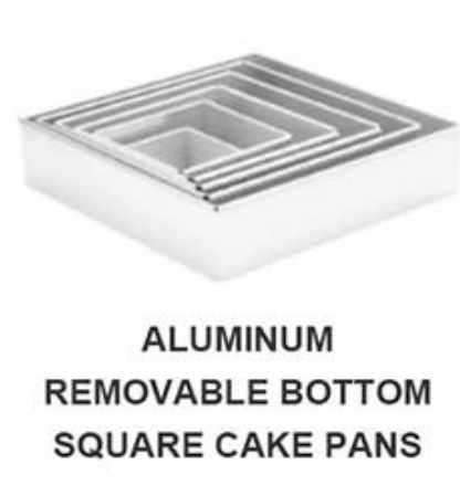
ALUMINUM REMOVABLE BOTTOM SQUARE CAKE PANS