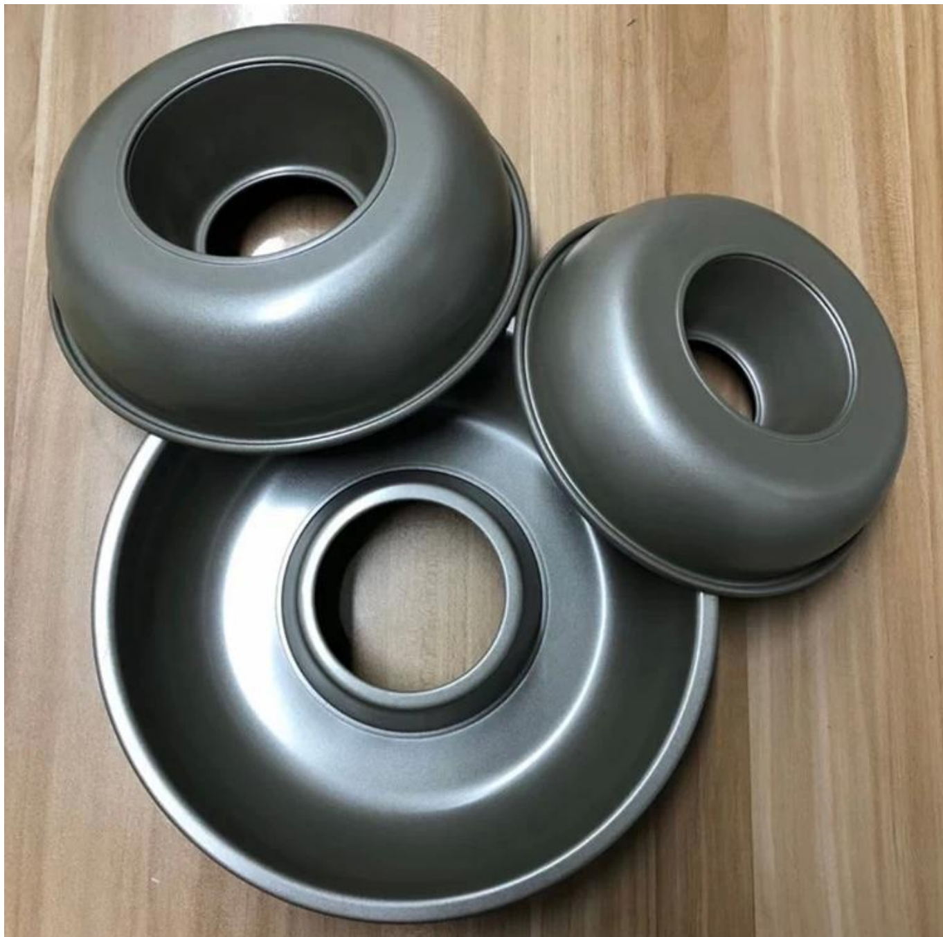
Cake Pan Factory Show