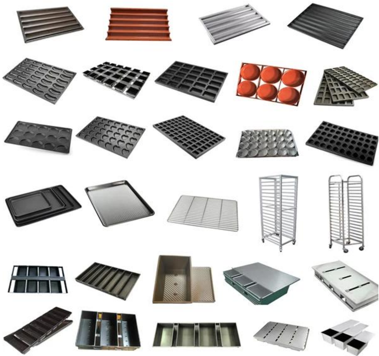
Factory production show