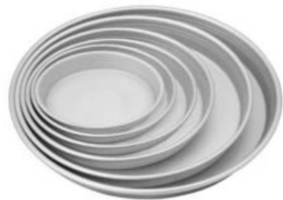
anodized aluminum alloy pizza pan