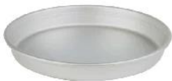
anodized aluminum alloy pizza pan