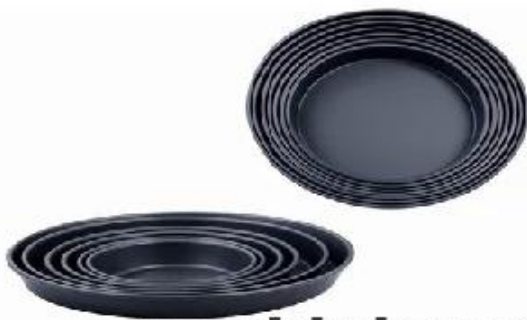
non-stick pizza pan