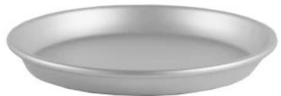
deep pizza pan