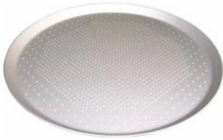
perforated pizza crisper pan