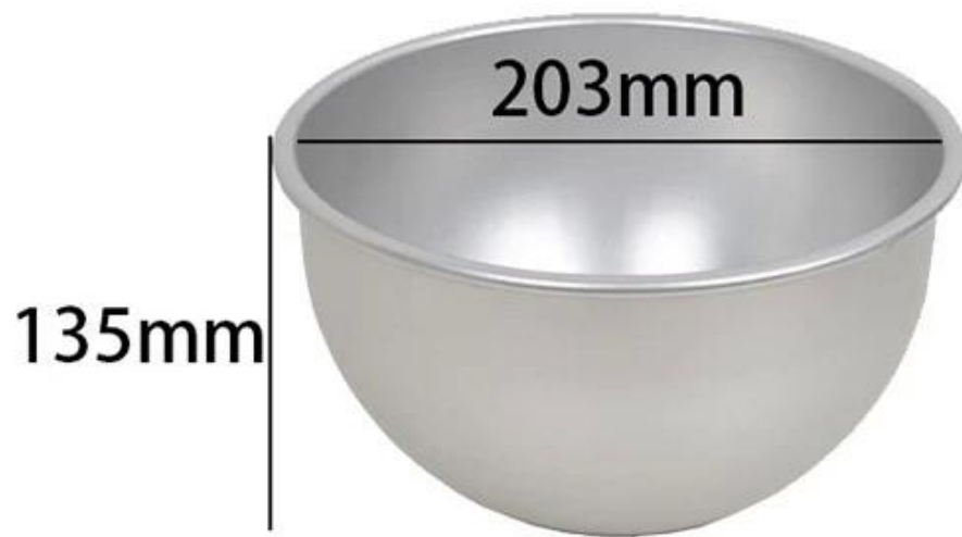
8 inch deep half ball mold