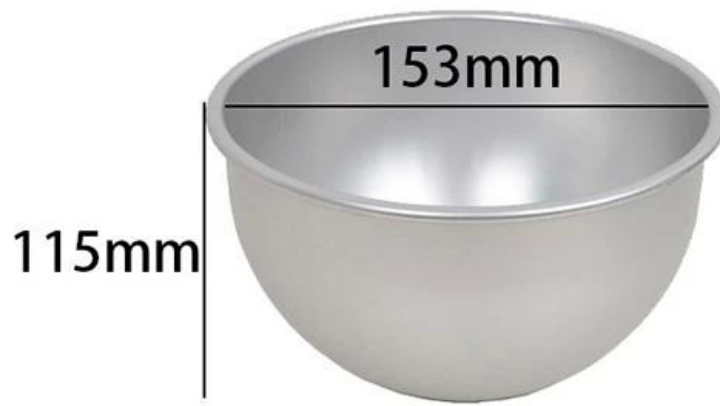
6 inch deep half ball mold