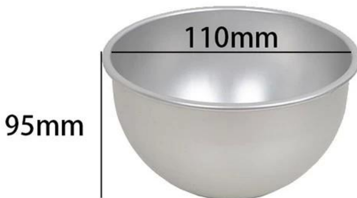
4 inch deep half ball mold